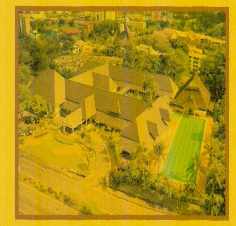
The Sarawak Club